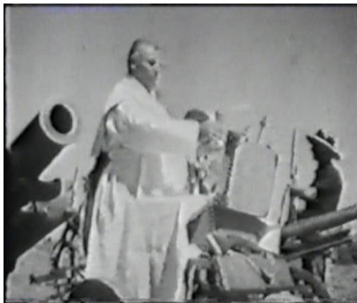
A Vatican clergy blessing the Fascist army

“The war against Ethiopia should be considered as a holy war, a crusade” (as Italian victory) would “open Ethiopia, a country of infidels and schismatics, to the expansion of the Catholic Faith.”