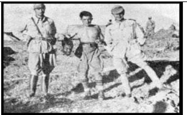
Italian Fascists posing after beheading an Ethiopian patriot