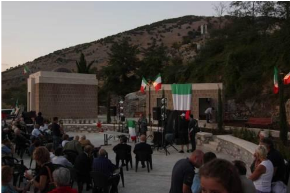
Rodolfo Graziani's mausoleum being inaugurated in the presence of a Vatican Representative