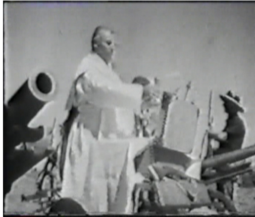
A Vatican clergy blessing the Fascist army