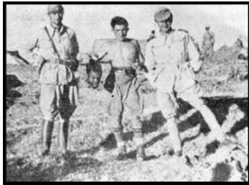
Italian Fascists posing after beheading an Ethiopian patriot